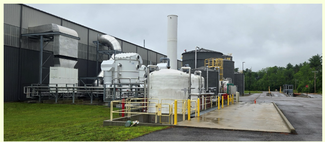
Odor abatement air scrubber system in the foreground; anaerobic digester in background

When fully operational, the plant will divert over 50% of the incoming waste from landfill by recycling traditional commodities and converting organic matter to natural gas. Innovative plans to look for additional waste diversion opportunities once both the front end and back end are complete.