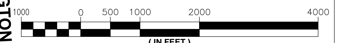
GRAPHIC SCALE 1" = 1000'