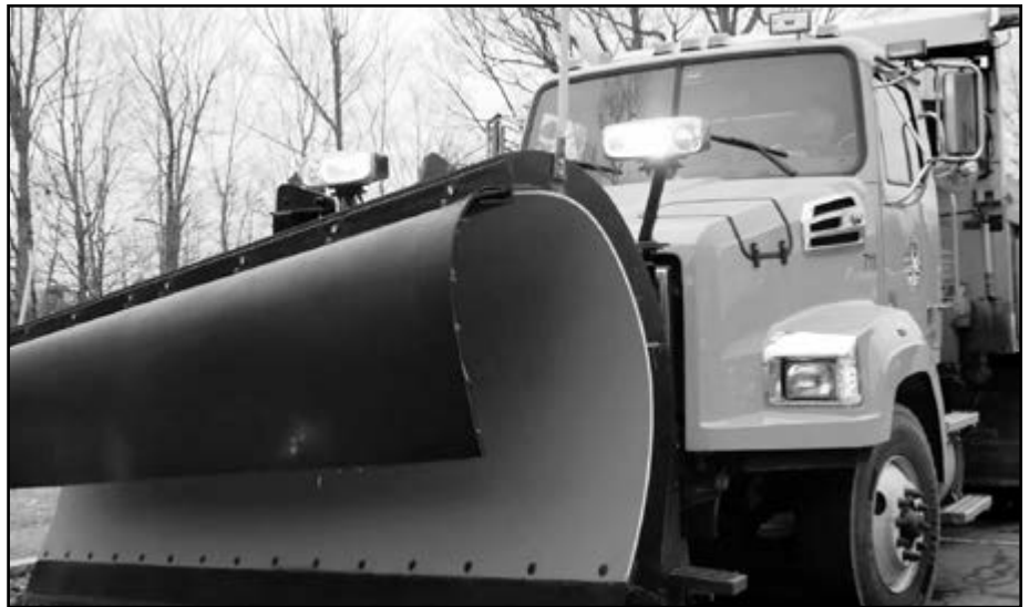
A city plow truck, ready and waiting.

Administrators and managers such as Cote and Bates also have more access to information. Actual snow plows haven't changed too much over the years, other than the aids provided by computerization of controls and instruments. Road treatment mixtures have evolved but essentially remain